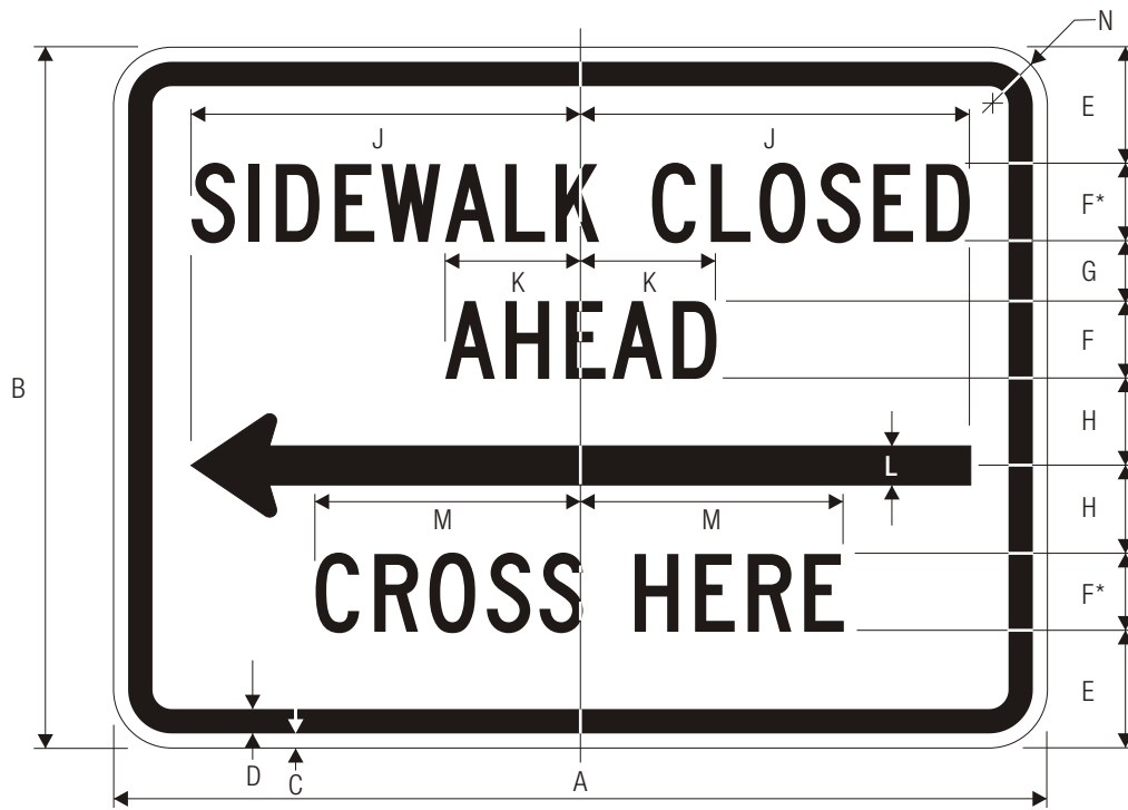
R9-11 SIDEWALK CLOSED AHEAD CROSS HERE