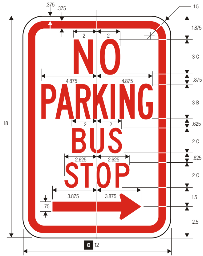
R7-7 NO PARKING

LEGEND – RED (RETROREFL) BACKGROUND – WHITE (RETROREFL)