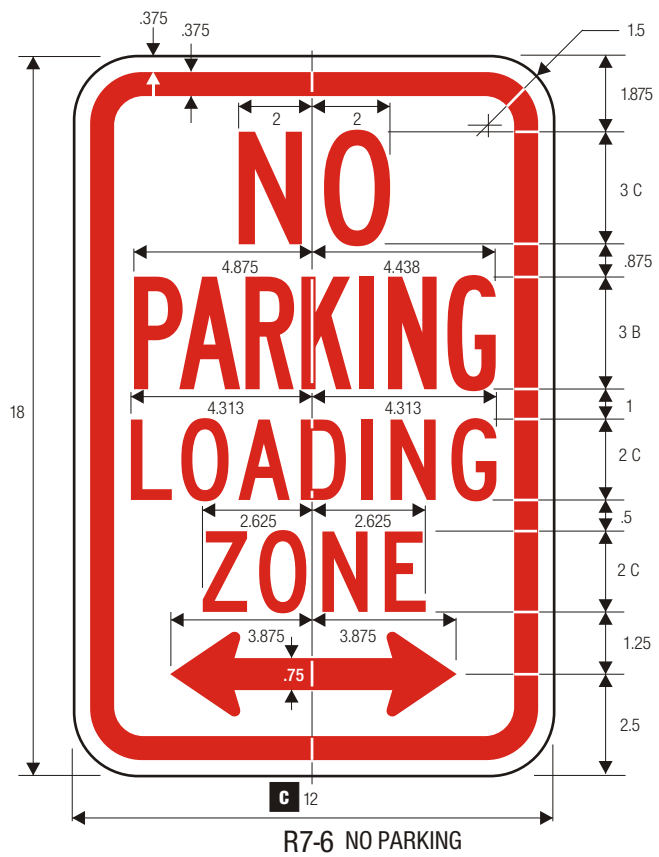
R7-6 NO PARKING

LEGEND – RED (RETROREFL) BACKGROUND – WHITE (RETROREFL)