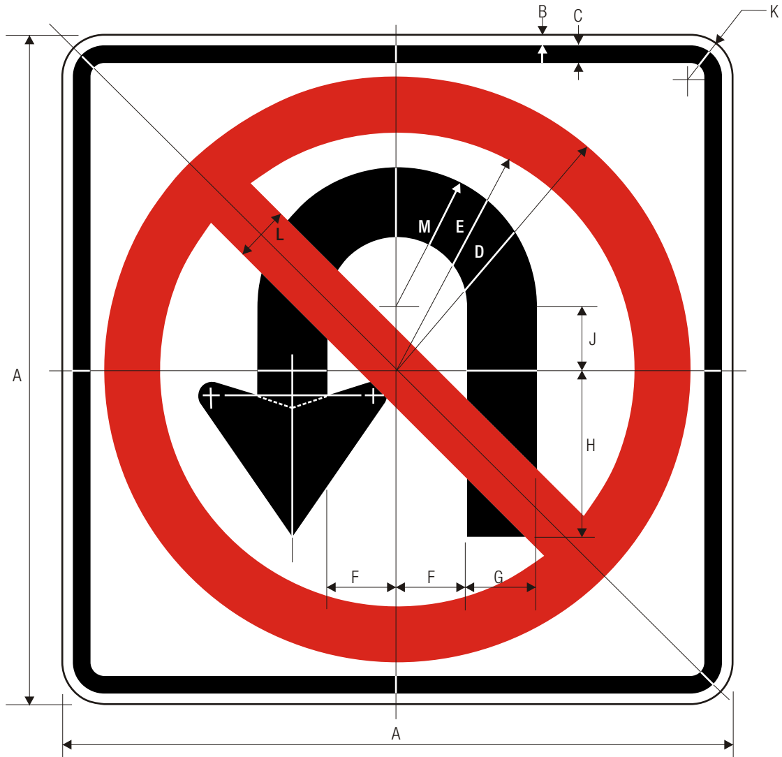
R3-4 U-TURN PROHIBITED