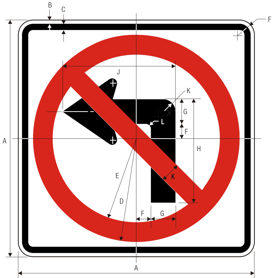
R3-2 LEFT TURN PROHIBITION