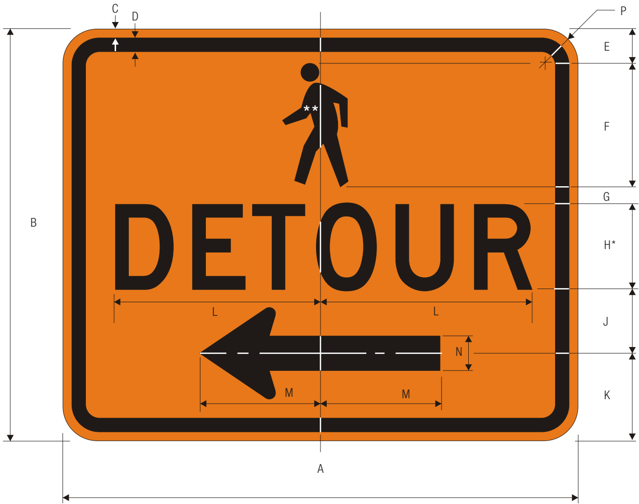
M4-9b PEDESTRIAN DETOUR

*Series 2000 Standard Alphabets. **See page 6-10 for symbol design. Optically center symbol about centerline.