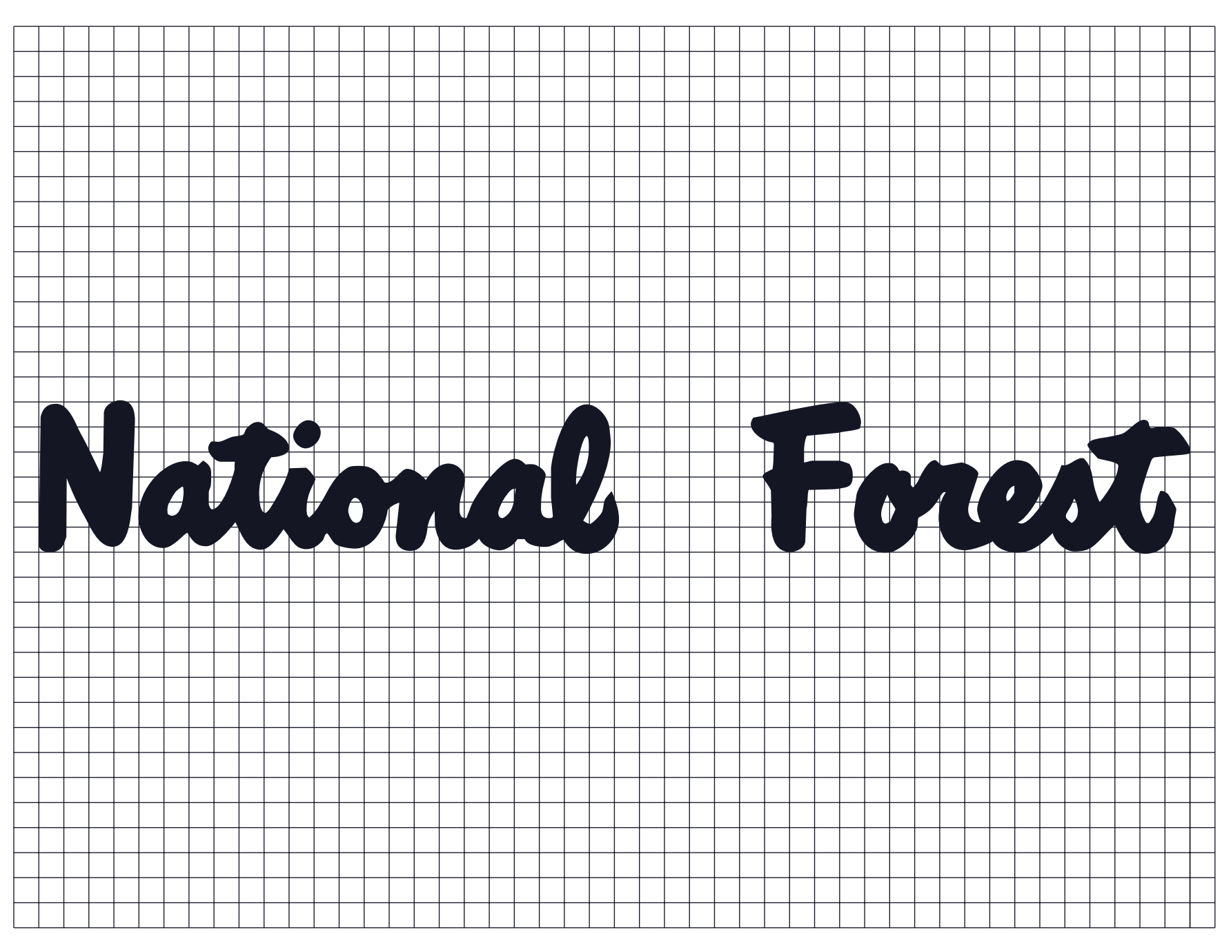
13-108, I3-108a symbol grid