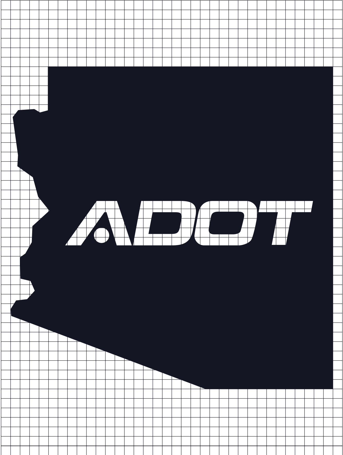
D14 series state outline symbol grid