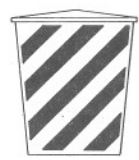
DESIGN D (Three barrel gore)