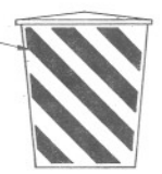
DESIGN B (Left side of highway)