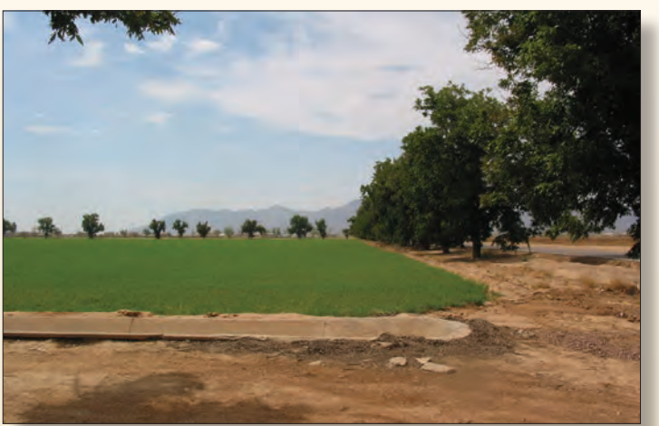
This agricultural scene exhibits strong elements of form, line, color, and texture—well representing the visual character component.