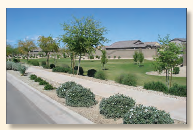
This residential landscape is unified, intact, and harmonious—well representing the visual quality component.

Visual sensitivity is a relative measure of viewer response to changes in the landscape. The primary viewer types in the Study Area include local residents (the majority of existing viewers), businesspersons, SMPP visitors, and daily commuters to destinations in the Study Area and in the Phoenix metropolitan area. Residents would likely respond to changes in the scenic quality of the landscape as viewed from their homes. Scenic viewing for these residents would also occur from local streets and parks. Views from SMPP would include vantage points from dispersed recreational activities such as hiking and mountain biking. Most viewers from areas of warehouse or industrial use (e.g., the Salt River channel, near I-10) would be assumed to have lower sensitivity to landscape changes.