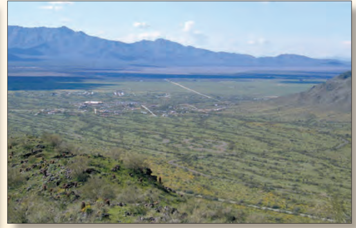
Hikers in the far western end of SMPP would likely notice any adverse visual changes in views toward the Sierra Estrella. Such landscapes well represent the visual sensitivity component.