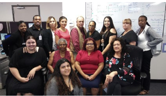
Phoenix Call Center

Moving a former Call Center CSR into a trainer position allowed the needs of other Call Center CSRs to be addressed. Virtual and physical huddles were also able to bring their needs to the forefront. By having the CSRs who are answering calls every day leading every huddle board meeting and offering their suggestions for how to do business better, faster and more efficiently, the MVD Call Center has been able to reduce a wait time of nearly half an hour to a record-low average of just under five minutes.