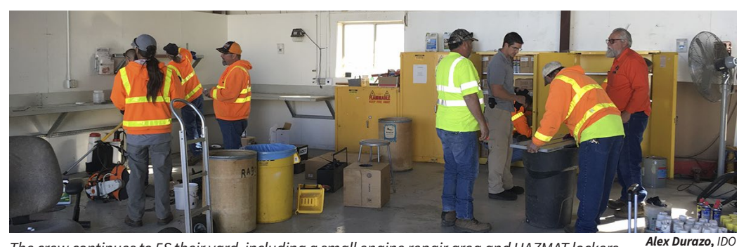
The \ crew \ continues \ to \ 5S \ their \ yard, including \ a \ small \ engine \ repair \ area \ and \ HAZMAT \ lockers.