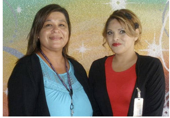
Perryville Call Center

When customers call in with questions that require answers from other departments, that can clog up the Call Center's available phone lines. By working