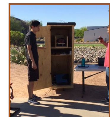
▲ The ASU students worked on the ADOT project as part of a two-semester professional design course required for all engineering majors. The team said they brainstormed a number of concepts before developing the prototype.