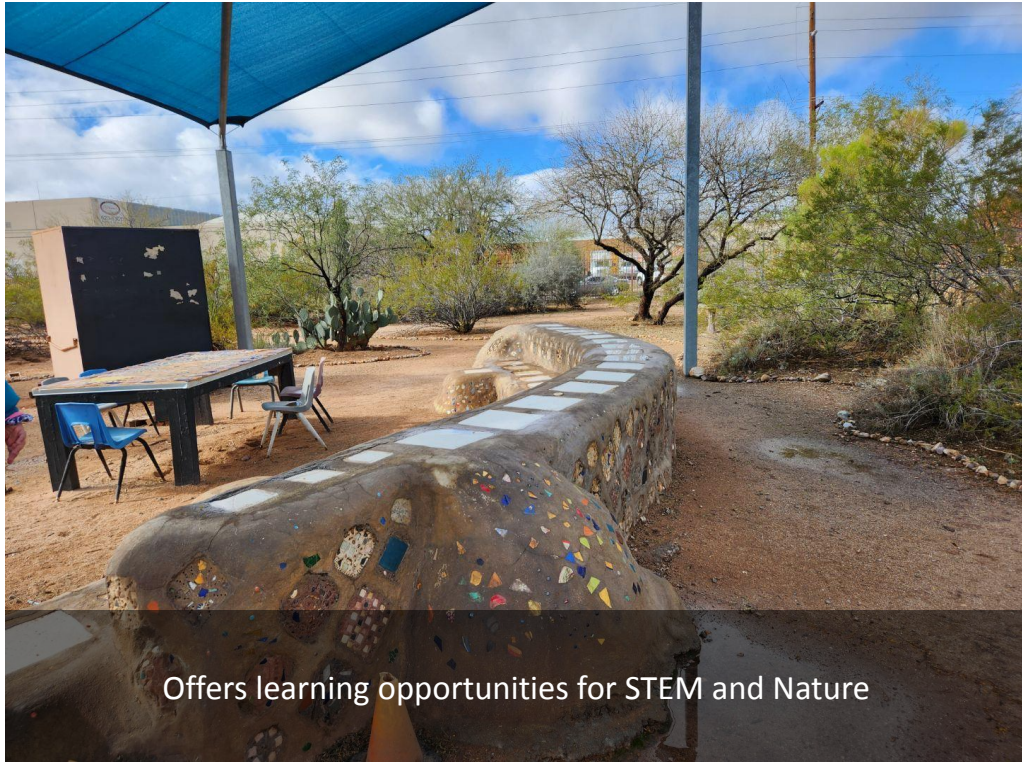
Offers learning opportunities for STEM and Nature