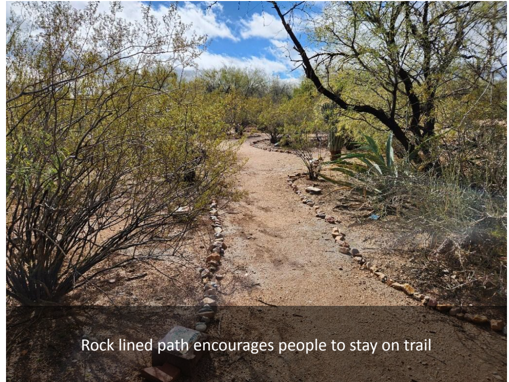
Rock lined path encourages people to stay on trail