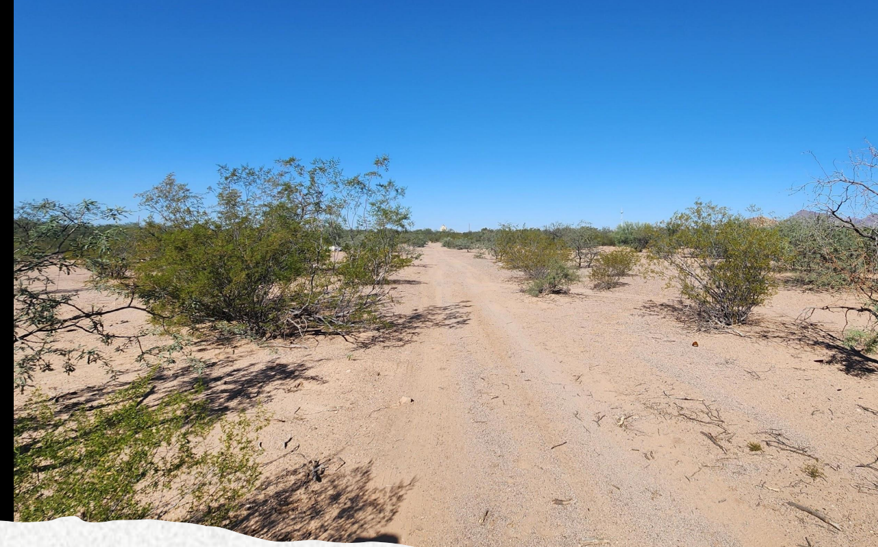
Black Wash Area -Current Conditions