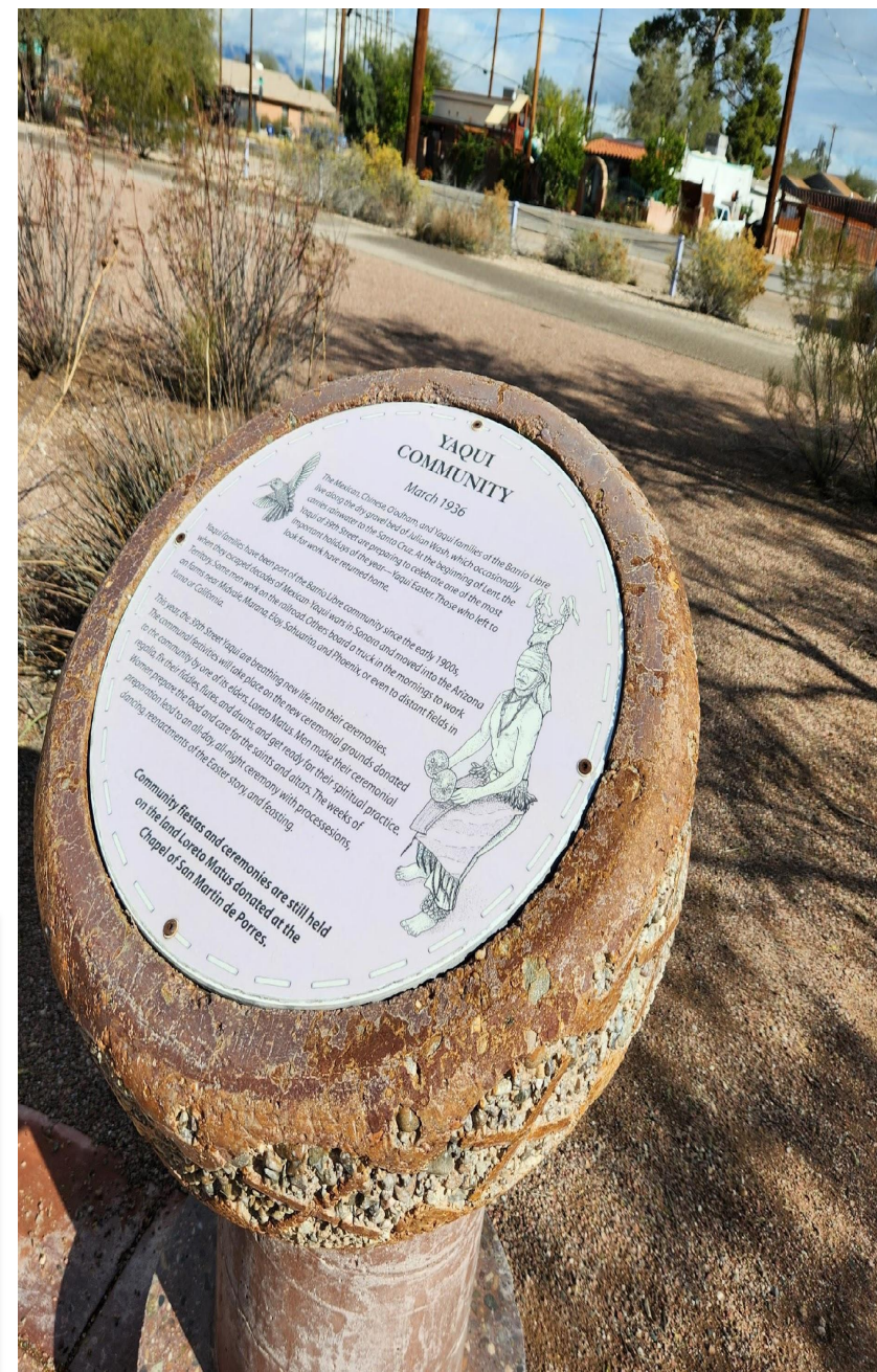
Example: Julian Wash Trail Art, signs and Permanent Shade Structures