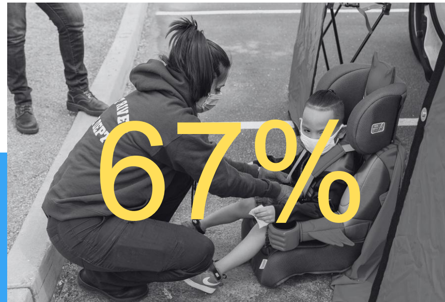
Car Seat Usage