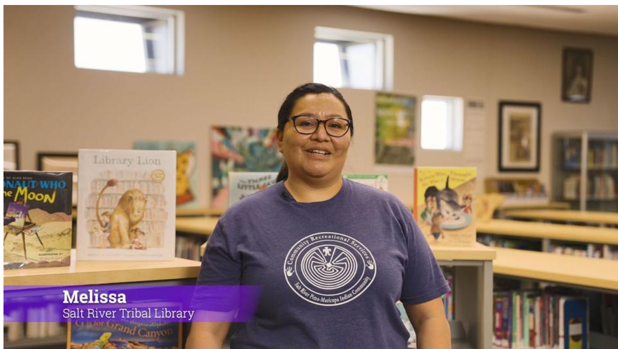
Melissa Salt River Tribal Library