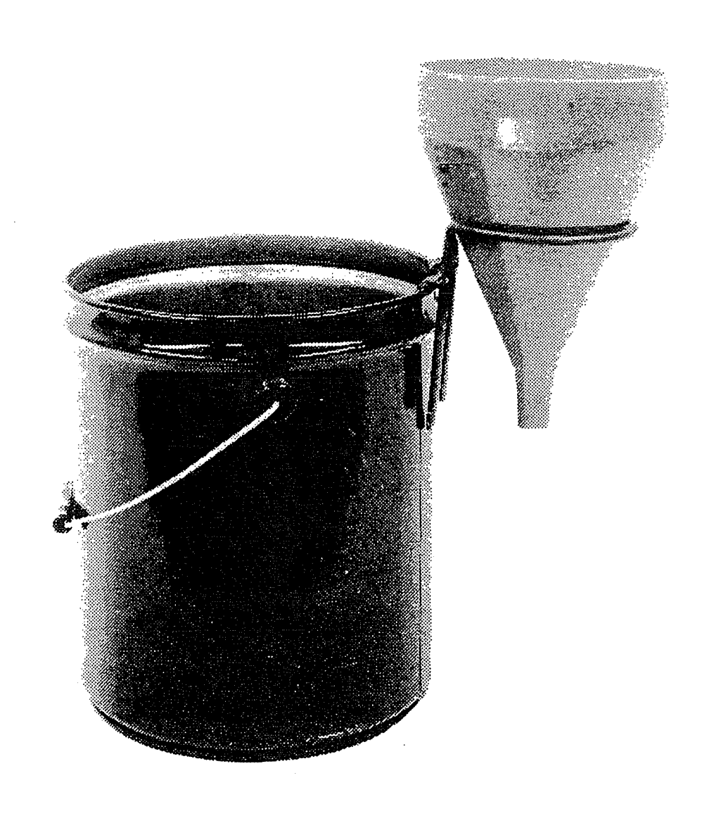
Grout Flow Test Apparatus FIGURE 2